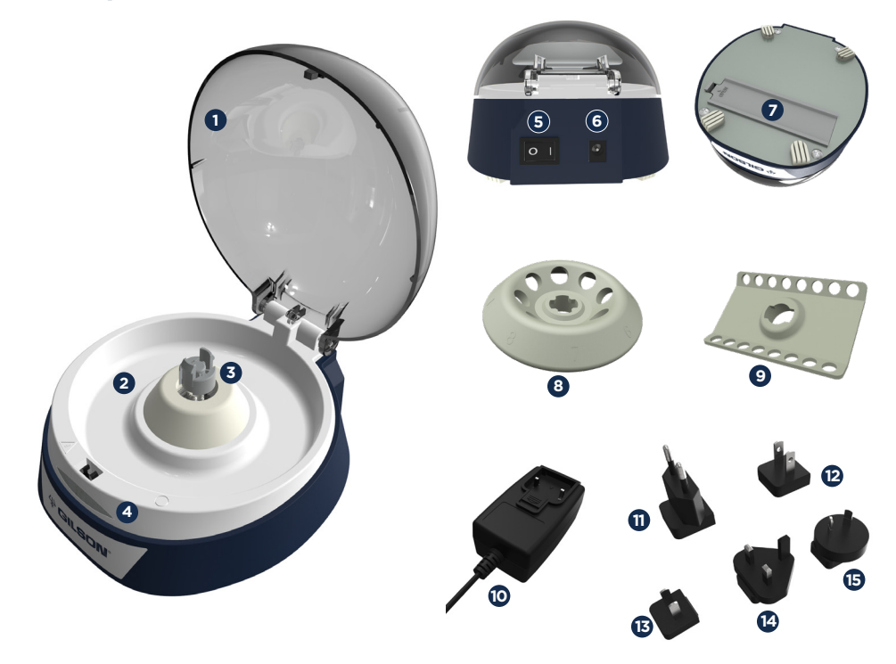
Figure 1 CENTRY™ 103 Minicentrifuge components