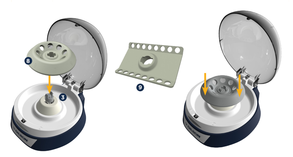
Figure 2 Install the rotor onto the motor shaft boss

Do not use any damaged, deformed, or corroded rotors. It may break the rotor while spinning and cause unexpected accidents or injury.