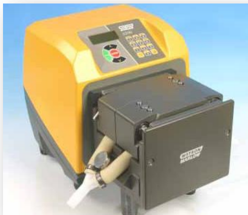
Figure 4. Watson Marlow 620 DI Pump with 625L head

Gilson offers the Automated Fly Food Dispenser with a Watson Marlow 620 DI Pump with 625L pump head ( Figure 4 ). Typical flow rate for the setup is around 1.4 L/min. While this configuration is recommended, it is also possible to work with other pumps as preferred by the end user. This may require some modifications to the software.