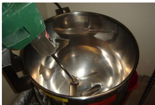
Figure 2. Heated pot with stirrer for making fruit fly larva food

These ingredients are mixed in a large heated pot with a large stainless steel stirrer ( Figure 2 ). The fungicidal agent is added last after the solution has cooled to prevent any heat inactivation. The solution is then ready to dispense into appropriate vessels.