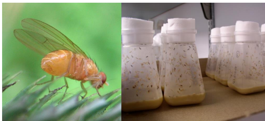
Figure 1. Drosophila melanogaster close up (left) and in a laboratory setting (right)

Drosophila research remains at the forefront of medical studies due partially to the fact that humans and fruit flies are quite similar at the molecular level. Around 75% of known human disease genes have a recognizable match in the genetic code of Drosophila melanogaster (Reiter, et al., 2001), and 50% of fly protein sequences have mammalian analogs.